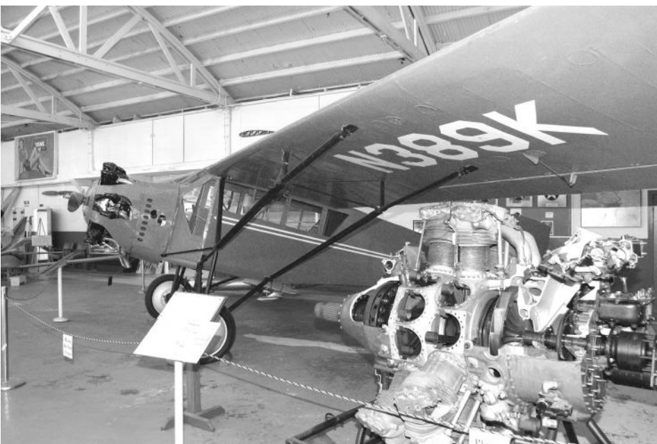
Curtiss Robin and cutaway Wright radial engine on display.