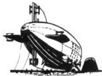
Moffett Field – 1933