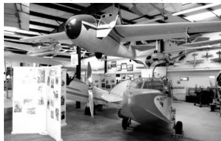
Exhibits inside display hangar

More information visit: www.wingsofhistory.org