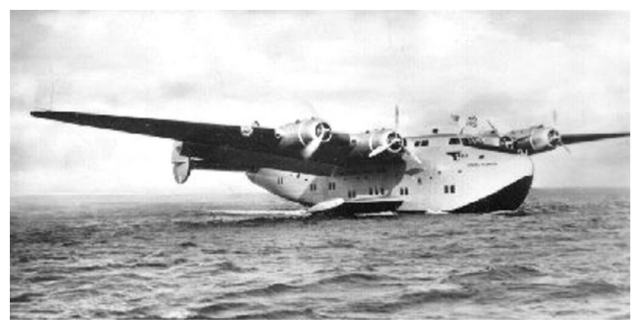
Boeing 314 Flying Boat - the Grandest Pan American Clipper of all.

From Alameda, and later Treasure Island, the well-heeled passengers traveled in luxury.