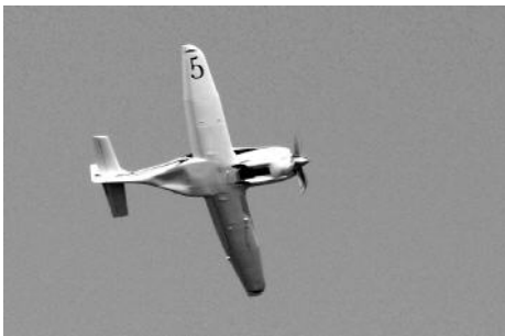
Lee Behel speeds to Gold win