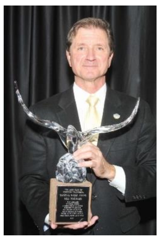
Rod Machado -- 2013 Crystal Eagle

Over the years, he earned a number of other pilot ratings, including airline transport pilot, although he usually flies a Cessna 150. He has logged more than 8,000 flight hours, most of it giving dual instruction. Machado has shared his humor and wisdom in books, videos and audio cassette albums, and in a monthly column, "License to Learn," for AOPA Pilot magazine.