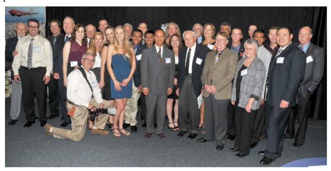
San Jose State University aviation students, faculty, graduates and former faculty gather at the 2013 Crystal Eagle Dinner where four scholarships were awarded to students.

year. Following graduation in December, he plans to enroll in an accelerated flight training program with ATP Flight School to pursue his goal of becoming a corporate pilot.