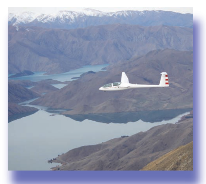
Steve Fossett and Einar Enevoldson flew this Perlan glider over 50,000 feet in 2006, setting the absolute altitude record for sailplanes.