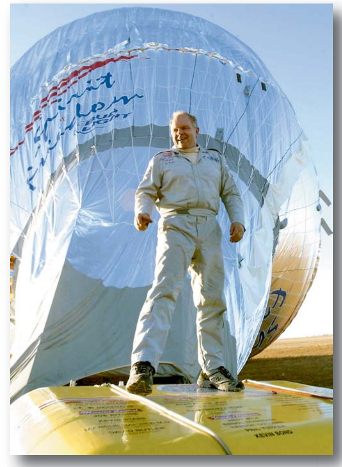
Steve Fossett celebrates after landing the Bud Light Spirt of Freedom in Queensland, Australia, completing his solo navigation of the globe in a hot-air balloon.