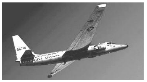
U-2 in Air Force markings on May 1, 1960, the falling wreckage took out two Soviet aircraft below.

The Powers incident brought the overflights into the open – and to an end. An embarrassed President