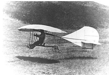
John J. Montgomery flies glider "The Evergreen" in 1911.